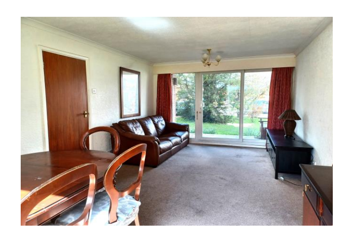
DOUBLE ASPECT LIVING ROOM with double glazed doors onto covered patio, radiator and picture window with view over communal gardens.