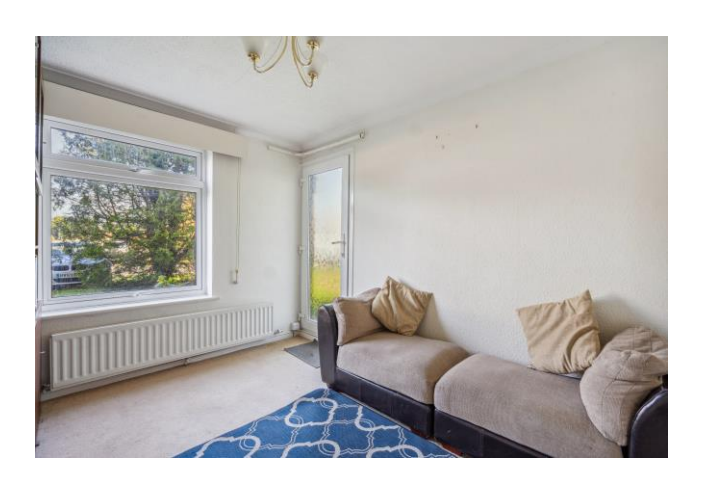
DINING ROOM/BEDROOM THREE radiator, double glazed door to patio.

BATHROOM with white suite of panel bath, Triton shower unit and screen, low level w.c., wash basin with vanity cupboard, vinyl floor, heated towel rail, radiator, tiled walls.